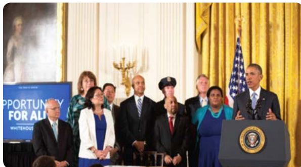
President Barack Obama delivers remarks before he signs an executive order to protect LGBT employees from workplace discrimination, in the East Room of the White House, July 21, 2014.

hire, promote, pay, and otherwise treat workers equally, without discrimination on the basis of race, sex, color, religion or national origin. By signing Executive Order 13672 , the President expanded this non-discrimination requirement to include sexual orientation and gender identity. In addition, President Obama updated equal employment opportunity rules enforced by other parts of the federal government that already protect federal workers from discrimination based on sexual orientation, by adding gender identity as a protected category.