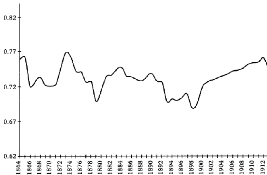
Figure 2. Rural-urban wage ratio, 1864-1913

wage gap, but it is unlikely that they completely eliminated it 85 . Hence there were definite gains to migration which were reflected in the continuing rural-urban flows.