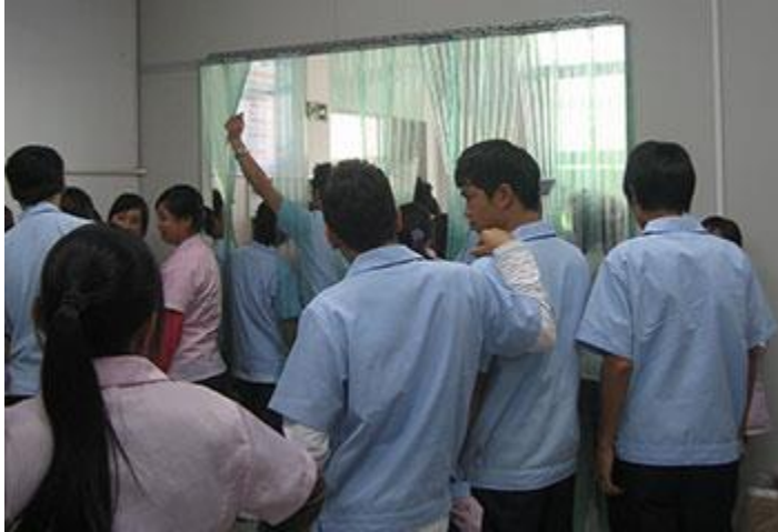
Workers lining up to swipe their cards