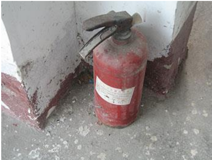
The fire hydrant lacks both an inspection time and a certification.

The fire hydrant lacks both an inspection time and a certification. There is only one fire extinguisher in the factory; it is rusty and empty.