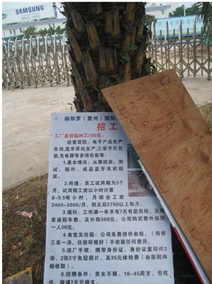
Dispatch company advertisement

These vary in size, price, and other attributes. Usually, an apartment will run between 150 to 300 RMB per worker. To rent an apartment, workers are often required to rent for at least 3 months. If they don't stay for that long, their one-month deposit won't be returned. Given the fact that many workers don't have much savings, many new workers will choose to live together with hometown friends or relatives, squeezing with one or two other people into one bed.