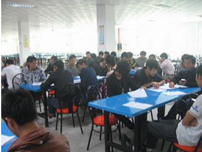
People filling out forms as part of recruitment