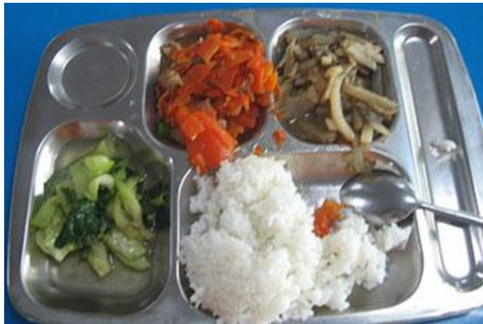
A meal at the cafeteria

If a worker loses her electrostatic ring, she is charged 10 RMB. If a worker scratches the paint off a phone, she is penalized 30 RMB on the spot. Management will penalize a worker 50 RMB if she takes too much rice and doesn't finish it. If a non-formal worker smokes in non-smoking areas, she will be penalized the entire month's subsidy, which may be as much as 200 RMB. Dispatch workers are fired for smoking in non-smoking areas. If a dorm room's lights are found to still be on after everyone is sleeping, everyone in the room is penalized 20 RMB.