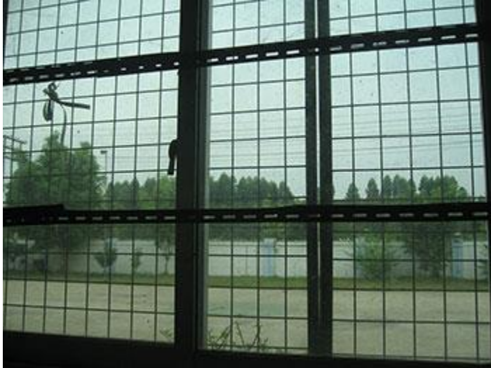
All factory windows have metal bars