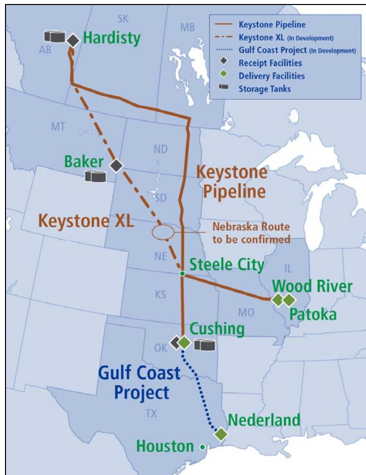
Figure 1. The TransCanada Keystone Pipeline System: Keystone and Keystone XL