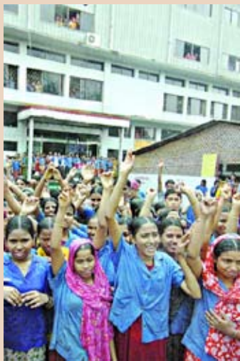
Workers at Chittagong Export Processing Zone demonstrating against the physical assault on two of their colleagues by a factory official, August 17, 2007.