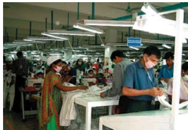
JMS Garments.

These, then, are the companies that appear to be involved in the production of Wal-Mart's school uniform shirt and the relationships between them that we can surmise: Wal-Mart licenses production of its private label Faded Glory school uniform shirts to Garan Inc., which designs the shirts and asks their neighbors in the Empire State Building, Jeasion International, to produce them according to Wal-Mart's requirements. Jeasion sends the design and the order (including the number of shirts and required turn-around time) to JMS Garments, which produces the finished shirts. JMS Garments loads the shirts on a truck which travels a mere 1.5 miles to the Chittagong port, where a ship picks them up and takes them first to the Port of Salalah in Oman, and then to the port of Charleston, South Carolina (this too we learn from PIERS). The Charleston port notifies Garan that the shirts have arrived, and Garan sends them to Wal-Mart, where we can buy them. Along these shirts' travel route, these companies all look to maximize their share of the profits.