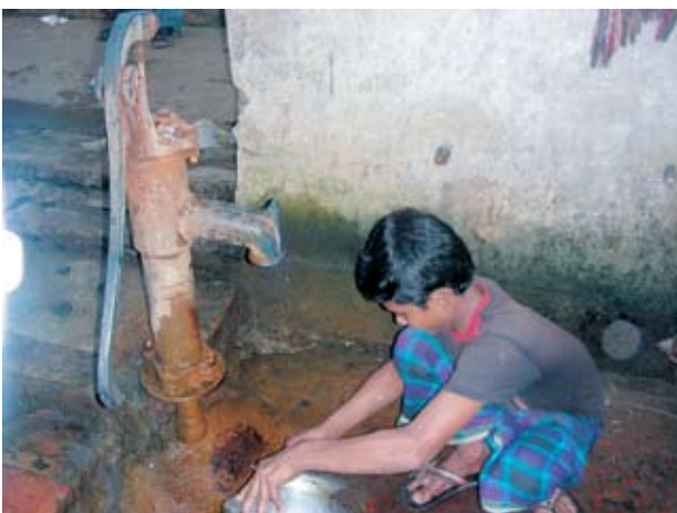
One well serves the whole colony where over 100 garment workers live. They use the water for all purposes, including washing and drinking. This boy is cleaning rice.