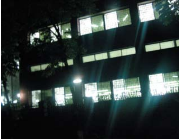
JMS Garments at night. Workers are working late.