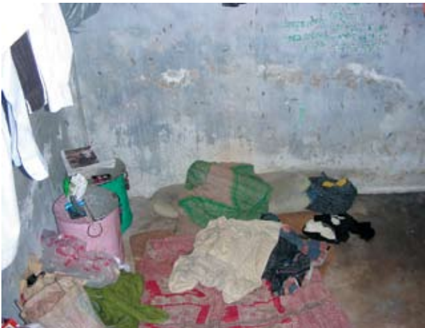
A pile of clothes which serves as bedding. The workers keep rice and some personal belongings in the drums in the corner of the room.