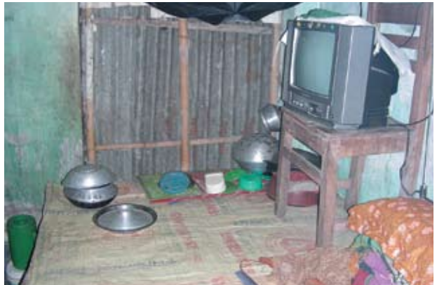
The other side of this worker's room. This is another worker's bed. Her bed is covered with cement bags. The bed also serves as her kitchen and TV room.