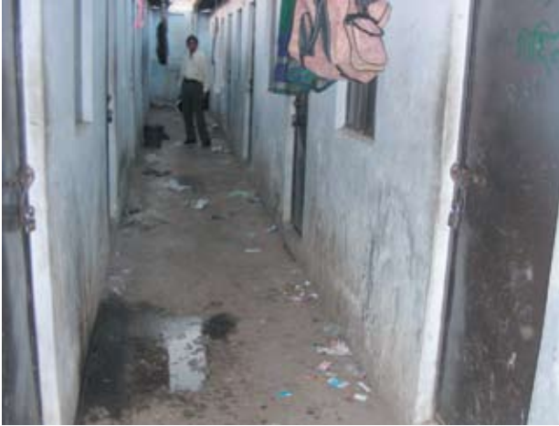
A “colony” of 24-30 rooms which houses at least 100 garment workers. The monthly rent for one room is $20-30.