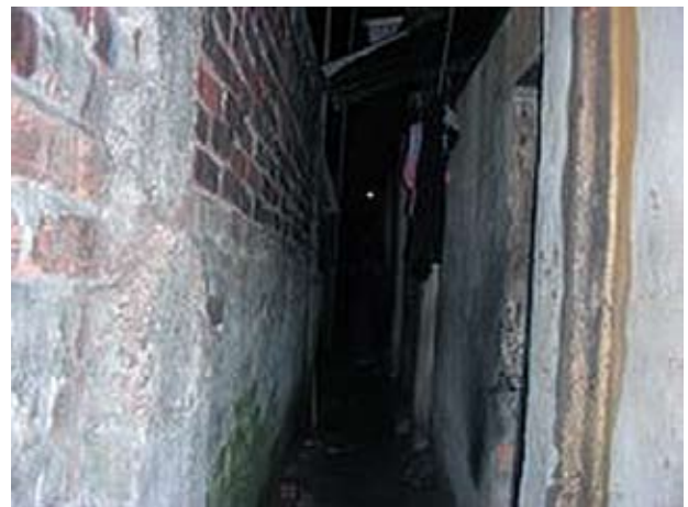
A very narrow entrance to their room.