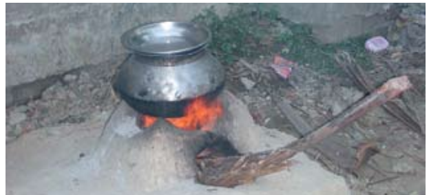
A typical clay cooker by the house of JMS Garments workers.