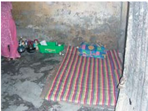
The room of a couple who work in a garment factory. They have nothing but this thin mattress in their room.