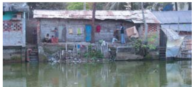
A house of five or six JMS Garments workers. There is no running water and no well, so the pond in the foreground serves for both washing dishes and bathing. On the right end a toilet is perched on top of the pond.

Workers report that talking is now permitted while working.