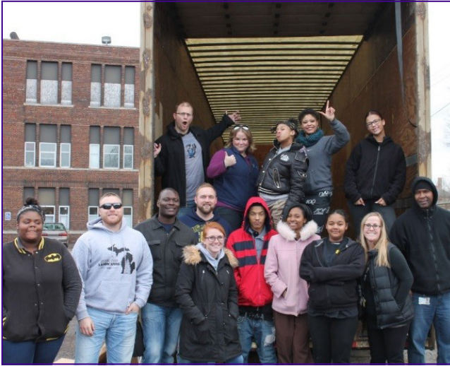
Youth and staff at an education and employment services program in MI.