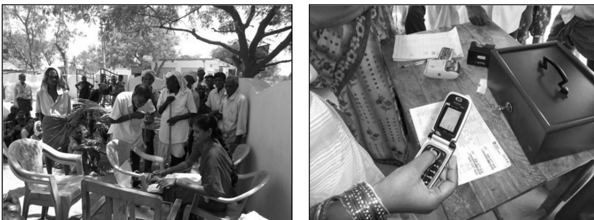
Figure 2: Payments Being Made to Pensioners by a Customer Service Point

Note: The kit for processing transactions includes a mobile phone, biometric scanner, and a printer.