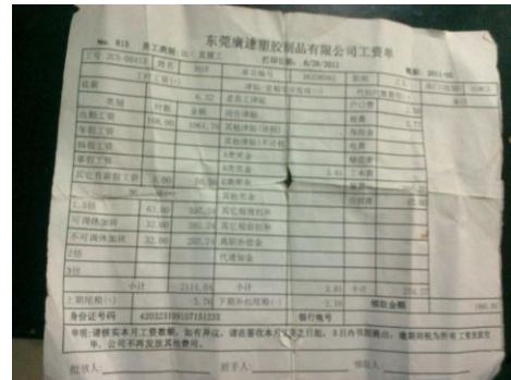
Worker's pay slip

Workers typically are paid 1,600 RMB/month after all monthly fees are deducted (utilities, food, fines, etc.). Each worker's base salary is 1,100 RMB/month, the minimum wage in Dongguan. Workers receive 9.48 RMB/hour for regular overtime and 12.64 RMB/hour for Saturday overtime.