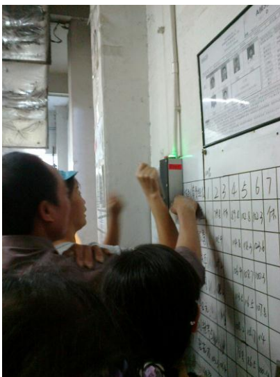
Swiping in to begin a shift

Workers must swipe their employee card at the front gate to enter and exit the factory. When entering the factory, workers must also hand their employee card to an inspector who will verify the registration number and make sure that each worker is using his own card. Workers must arrive at their respective workshops fifteen minutes before the beginning of the shift. Further, workers are not able to swipe out at the end of the shift until a minute or two after the shift time has passed.