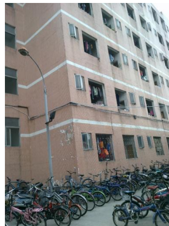
Outside the Dorms

The factory has a cafeteria that provides communal meals. Cafeteria food is subcontracted out to another company. The factory only provides lunch. For 5 Yuan ($.80 USD), employees receive three dishes and one soup. Workers simply need to swipe their employee card in the cafeteria and the 5 Yuan will be automatically deducted from their account. Workers expressed that the cafeteria food is poor; it is not cooked with oil and most of the meat is fat. Outside of the factory, one can purchase a boxed lunch that contains two meat and two vegetable dishes for the same price.