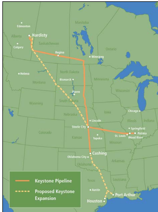
Figure 1. TransCanada Keystone Pipeline and Original Keystone XL Proposed Route