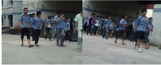
• Pic 3 Workers on-site on a Sunday

According to the employee manual and the wages article, employees' wages should be paid on the 22nd of each month. However, the factory actually pays wages on the last week of each month, on Tuesday or Friday afternoon. If, during the month, the factory suspends work, the wage payment date extends beyond the duration of the shutdown. The payment of wages clause in the employee manual and the actual time of payment of wages are inconsistent.