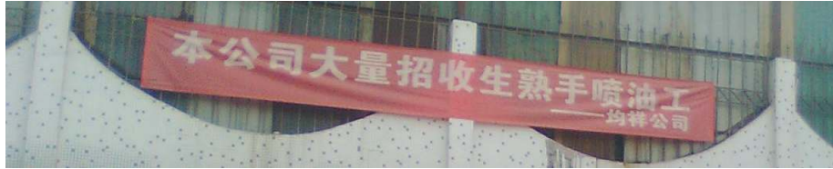
• Pic 11 Bar stating that, direct recruitment is in process, with lots of opening positions.

Workers do not go through a physical exam before employment. All employees will be provided with one-hour orientation training on factory policies, work safety, and so on. Workers are paid during the training period. Contract workers should wear the uniform provided by the factory for free, but the uniform should be returned when a worker leaves the factory.