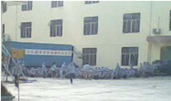
• Pic 2 On a morning meeting.

Employees have a weekly morning meeting with leaders in the factory, including supervisors of the workshops. Regardless of who is running the meeting, employees must arrive at the workshop ten minutes earlier than usual to wait for the leader of the meeting. All of the workers kneel to listen to the leader speak. When the supervisor or manager is unsatisfied with employees' work performance from the previous week, the leader severely chastises workers.