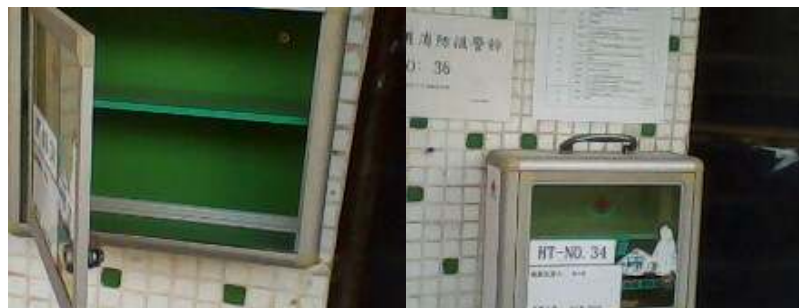
• Pic 4 Empty first aid kit.

These supposed entertainment facilities are only there for looks. The factory's employees are only able to engage in a few activities in the nearby area, including surfing the Internet in an underground Internet cafe, cross-stitching, or shopping.