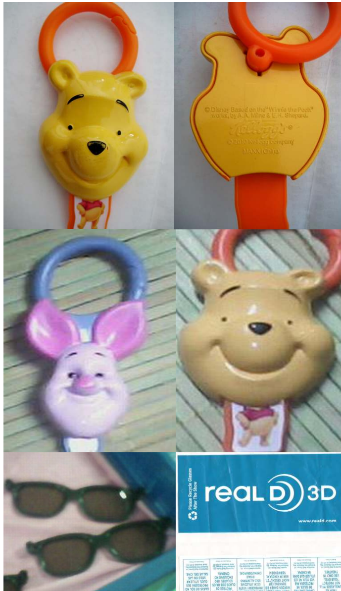
• Pic 1 Products of Hengtai.