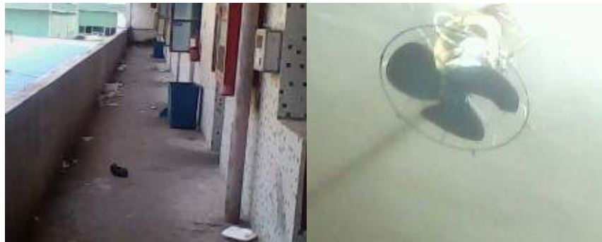
• Pic 9 The hallway of dormitory building.