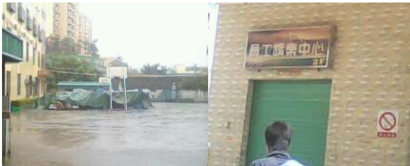
• Pic 5 Basketball court (left) and Recreation Center (right).

During the probation period, employees are not permitted to buy pension insurance. After the probation period has ended, if employees want to purchase insurance, they must fill out a written application, but only after they have paid for it in full. During the new employees training orientation, human resources staff tells workers, "You all are not from Guangdong province, buying this for such a short time is useless. Even if you buy it now, you cannot retire, so it is best not to buy it. But if you really want to buy it, wait until after the probation period is over and then apply."