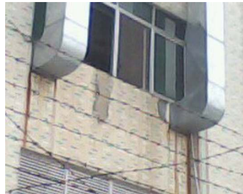
• Pic 12 Exterior view of the factory building.

The use of factory dormitory and canteen is optional, and the service is quite acceptable. The monthly lodging fee is about $4.4 (30 RMB) and the daily dining expense is about $0.88 (6 RMB) including lunch and dinner. Containing 4 bunk beds, a dormitory room can house eight people at most, but usually rooms are not filled. Each dormitory room has its own individual bathroom and hot water is available every night from 10 p.m. to 11:30 p.m. The factory canteen is on the first floor of the dormitory building. Workers each can get three dishes and one soup. All tableware is sterilized, which many employees feel happy about.