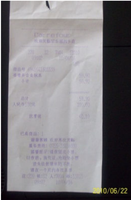
Pic 5 Receipt indicates the toy is purchased from Carrefour store.

Based on the facts above, we are not satisfied with the response of Carrefour. China Labor Watch suggests Carrefour improve the management of its supply chain, control comprehensive information on its suppliers, and take action to improve the working and living conditions of its labor workers to fulfill its social responsibility.