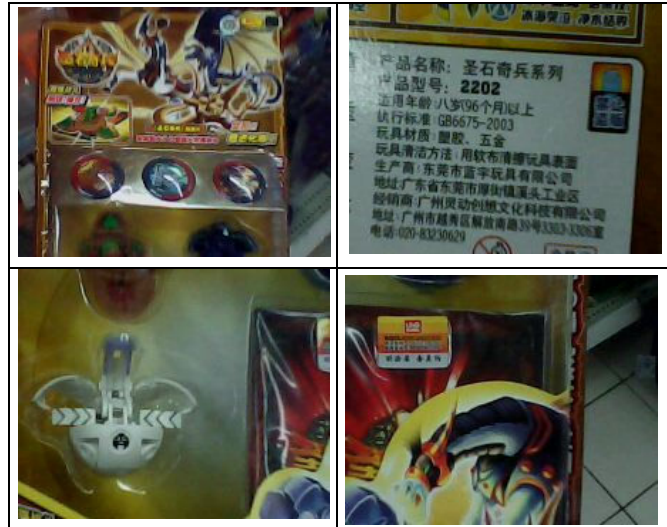
Pic 4 Logos and labels clearly indicate the toy is manufactured by Lanyu.