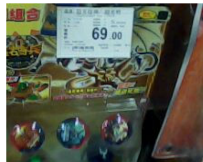
Pic 2 Toy manufactured by Lanyu on sale in a Carrefour store.

Before the release of this report, CLW has provided the names of the four suppliers to Carrefour through email on April 21, requesting for confirmation. CLW has never received any response until now. However, after the release, Carrefour did respond to French and Polish journalists, and our French partner Peuples Solidaires, that: 1) Xinlong