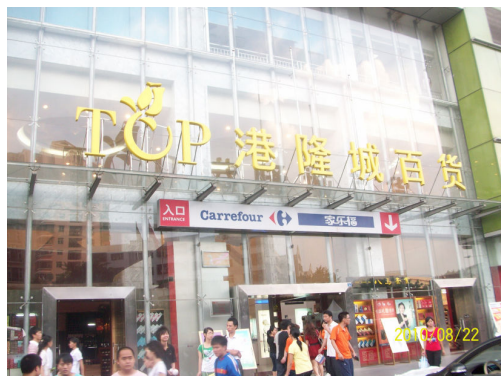
Pic 1 External view of the Carrefour store investigated

China Labor Watch (CLW) is a New York-based Non-government Organization committed to reducing sweatshops in China and to improving working and living conditions of Chinese labor workers. Between February and April of 2010, CLW located and investigated four suppliers of Carrefour, the second largest big box store in the world: Dongguan Lanyu Toy Company, Kiddieland Toys, Shenzhen Nanling Toys Products and the Xinlong factory. The investigations showed many violations of Chinese labor law in these factories: Many employees