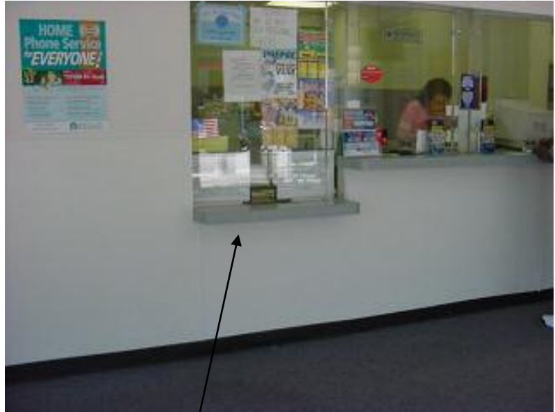
An accessible counter at a check cashing center.

General sales and display area shall be made accessible. Sales employee work stations shall be located on accessible levels, and the customer side of sales or check-out station shall be accessible. Employee work areas shall be sized and arranged to provide access to employees in wheel chairs.