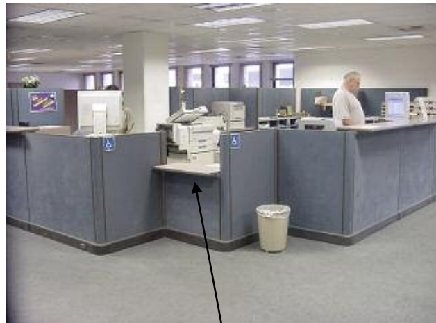
Minimum 36" long, maximum 34" high.

Circulation aisles and pedestrian ways shall be sized according to functional requirements and in no case shall be less than 36" in clear width.