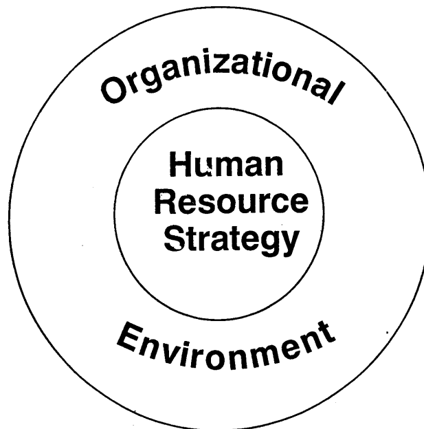
EXHIBIT 1: The Strategic Perspective

A simplified model of the strategic perspective, derived from the preceding material, is shown in Exhibit 1. It is meant to reinforce the importance of internal and external fit. Theorists (and researchers) approach this model in several different ways. Some attempt to bring clarity to one or both of the major components -- human resource strategy and organizational environment. Others seek to clarify relationships between the two components. The latter, in turn, fall in two camps: those who start with the organizational environment and work inward, referred to here as multiple model theorists (MMTs), and those who start with a human resource strategy and work out, the dominant model theorists (DMTs). What follows is an illustrative and reasonably comprehensive (but certainly not exhaustive) review of this work.