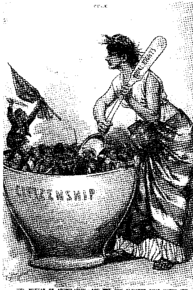
THE NUMBER OF AMNESTY HAS THE ONE ELEMENT THAT WON'T MIX