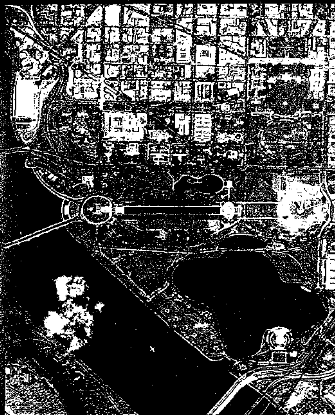
Aerial view of the Mall in Washington DC

Experience quickly revealed, however, that IRCA had serious weaknesses. Without a reliable and verifiable worker identification system in place,