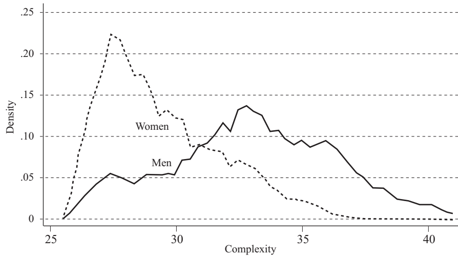
Figure 2. Kernel Estimates of the Male and Female Distributions of Complexity at the Initial Job Assignment.

We follow two approaches to answer this question. First we take advantage of the fact that the occupation-related wage is a continuous variable. Thus, changes in occupation-related wages conveniently summarize both the extent and direction of change in the complexity of the jobs that the worker was performing.