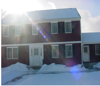
Chris's home at Pathfinder Village