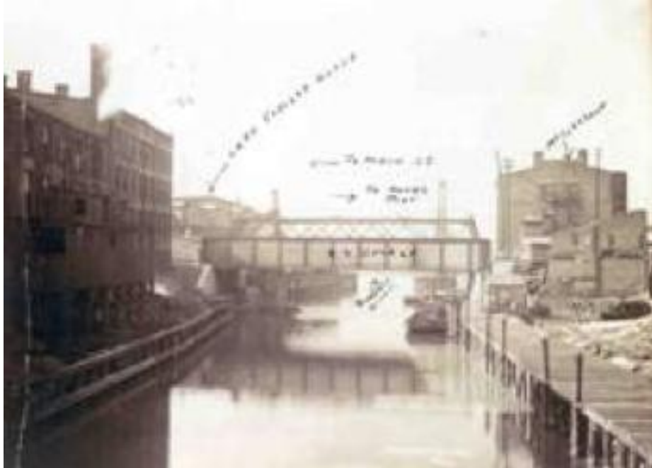
The Canal Harbor