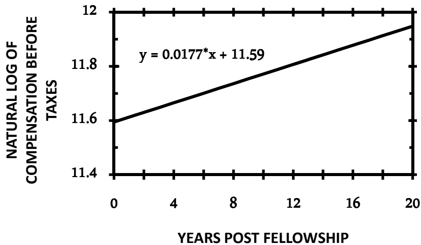
Fig. 1. The relationship between years post fellowship and the natural log of pre-tax annual earnings is described by the equation/linear function derived from a Tobit regression model. The model controlled for gender, employer, total work time/wk, half-days/wk spent on research, and for bias occasioned by missing observations. The equation predicts that the average annual pre-tax earnings of rheumatologists, early in their careers, increased by about 1.8 %/year of post fellowship experience.