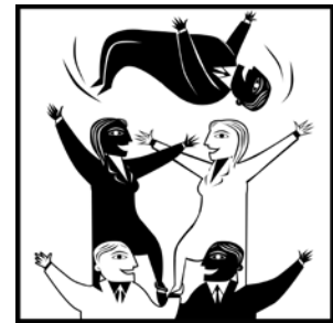
Figure: Building a Learning Organization

For organizations wishing to remain relevant and thrive, learning better and faster is critically important. Many organizations apply quick and easy fixes often driven by technology. Most are futile attempts to create organizational change. However, organizational learning is neither possible nor sustainable without understanding what drives it. The figure below shows the subsystems of a learning organization: organization, people, knowledge, and technology. Each subsystem supports the others in magnifying the learning as it permeates across the system.