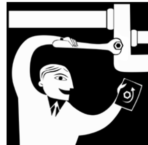
Figure 1: Learning from Experience

Conventional approaches to learning hinge on the presentation of knowledge and skills. Then again, knowledge is revealed through methods of questioning amid risk, confusion, and opportunity. Reginald Revans, the originator of action learning, recommended that one should keep away from experts with prefabricated answers. 1 Rather, people should become aware of their lack of knowledge and be prepared to explore their ignorance with suitable questions and help from others: finding the right questions rather than the right answers is important, and it is one's perception of a problem, one's evaluation of what is to be gained by solving it, and one's estimation of the resources available to solve it that supply the springs of human action. 2 Figure 1 depicts the cycle of learning.