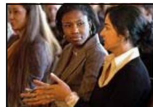
Two students at an entrepreneurial studies workshop at Anne Arundel Community College

visit www.iccd.cornell.edu/iccd/researchGrants/appliedResearchGrant/2006-Project-Reports.html