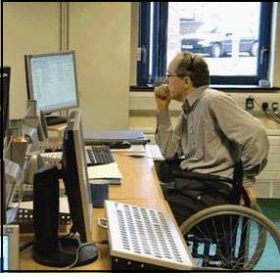
A voice activation Web accessibility tester

User testing in Web design is critical for all users of community college websites, not just users with disabilities.